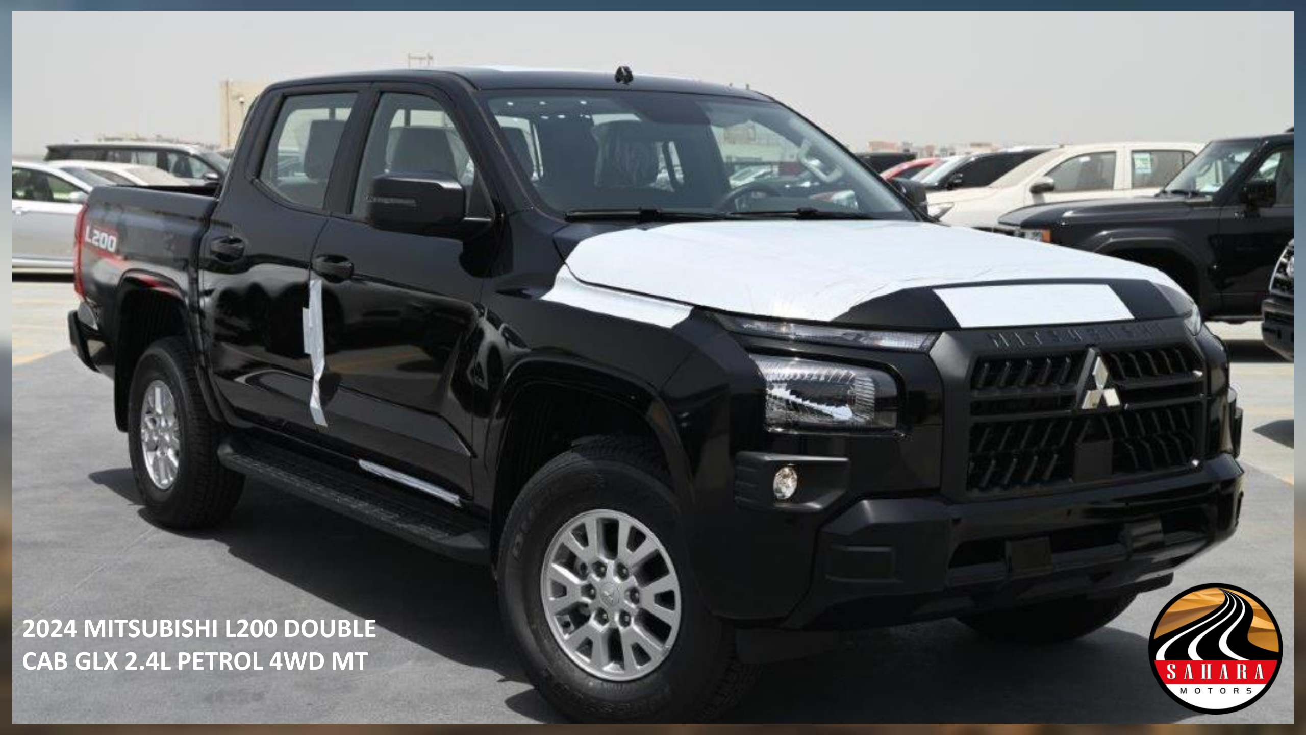
2024 MITSUBISHI L200 DOUBLE CAB GLX 2.4L PETROL 4WD MT