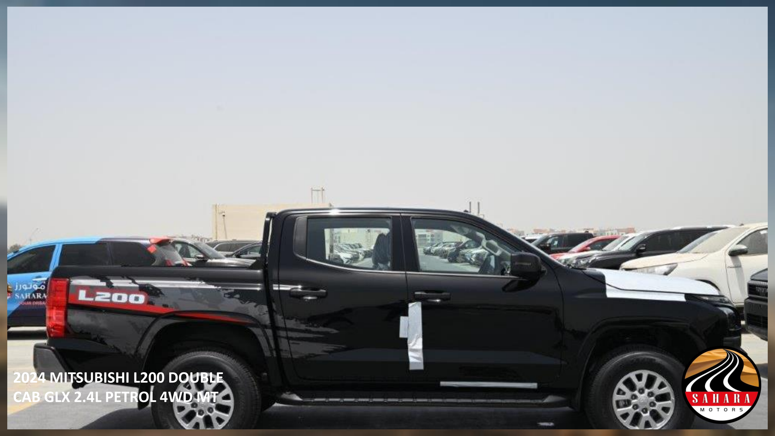
2024 MITSUBISHI L200 DOUBLE CAB GLX 2.4L PETROL 4WD MT