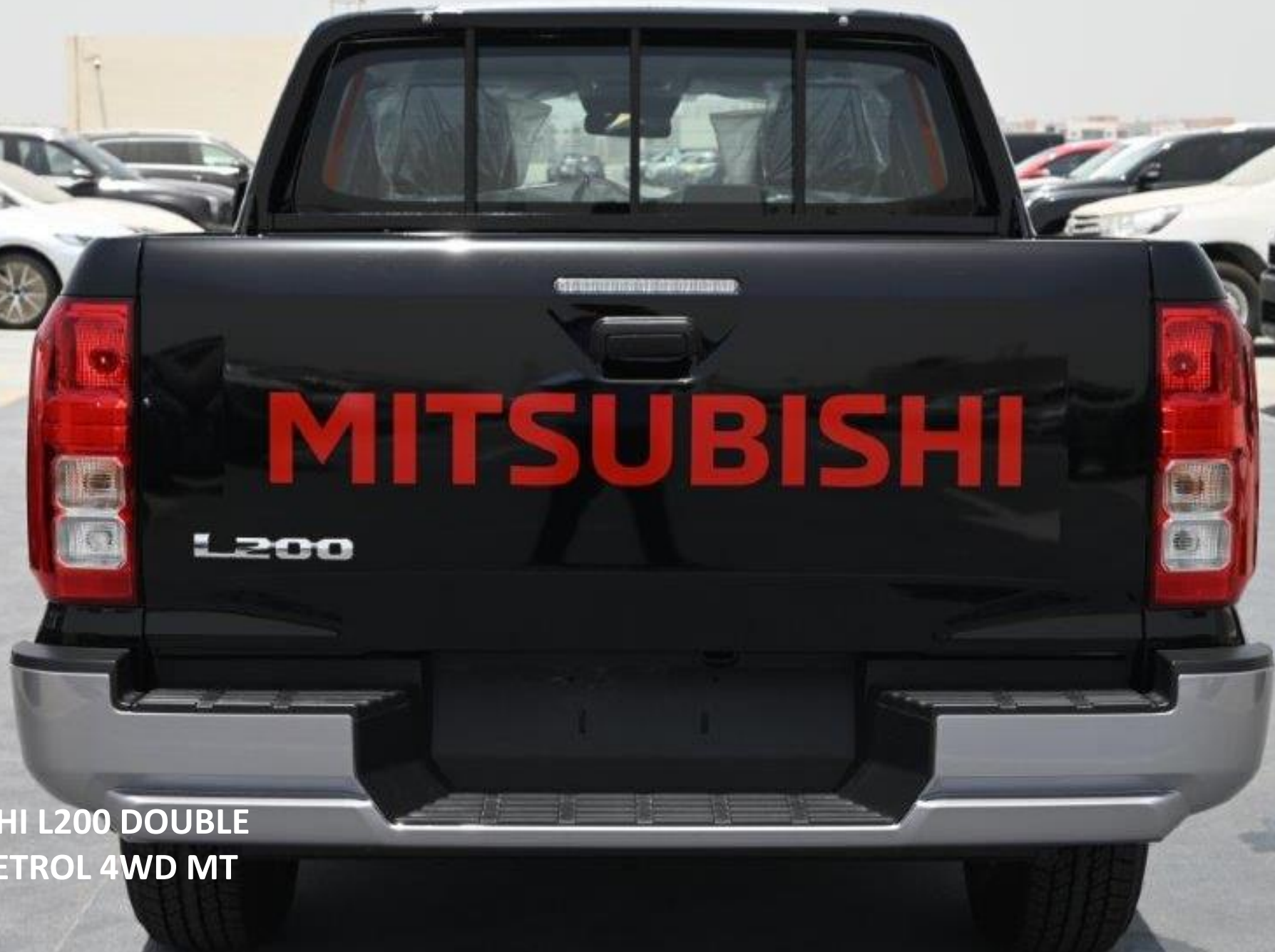
2024 MITSUBISHI L200 DOUBLE CAB GLX 2.4L PETROL 4WD MT