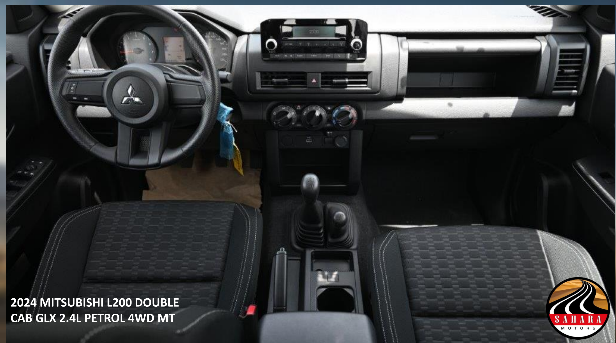
2024 MITSUBISHI L200 DOUBLE CAB GLX 2.4L PETROL 4WD MT