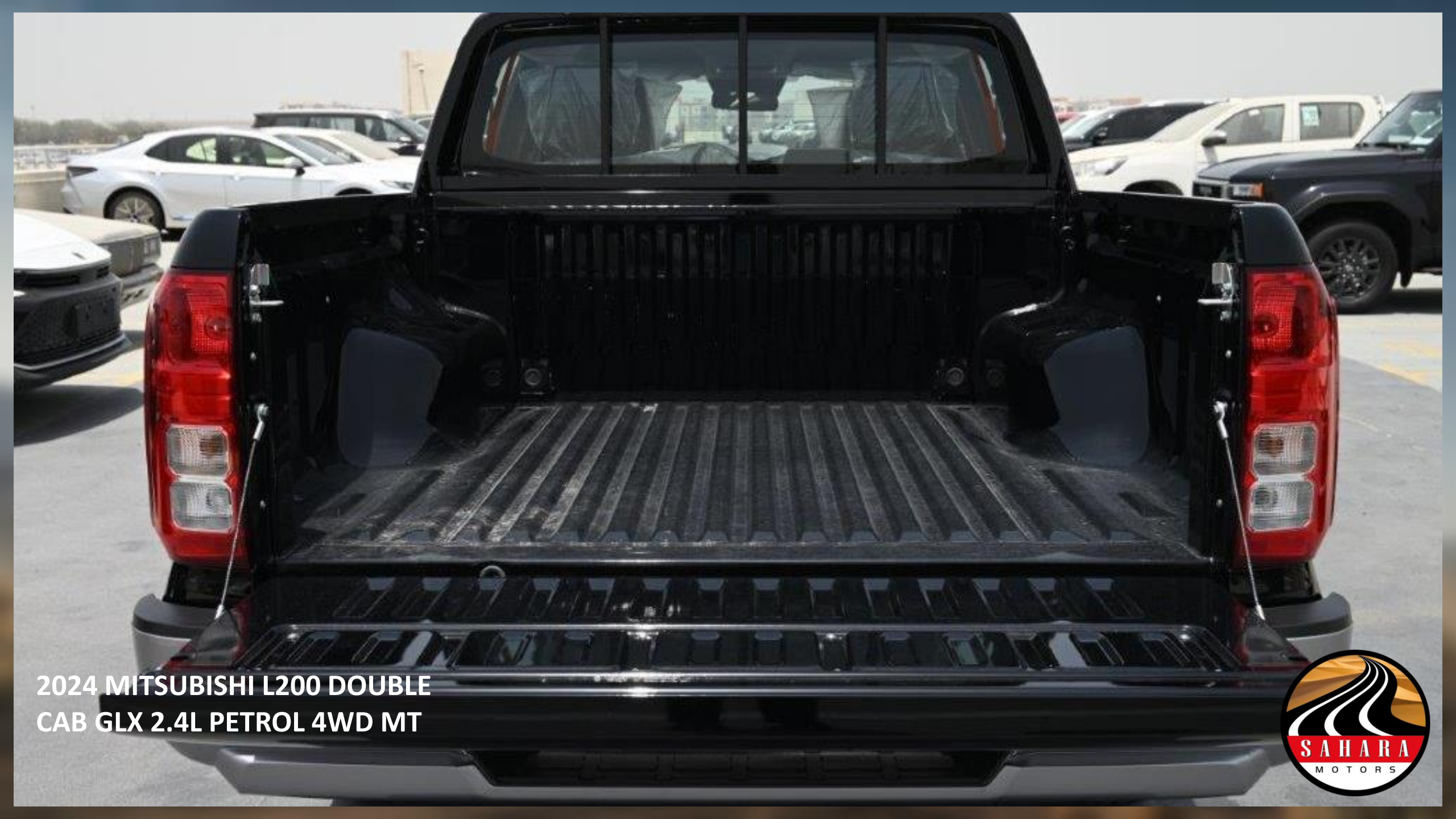
2024 MITSUBISHI L200 DOUBLE CAB GLX 2.4L PETROL 4WD MT