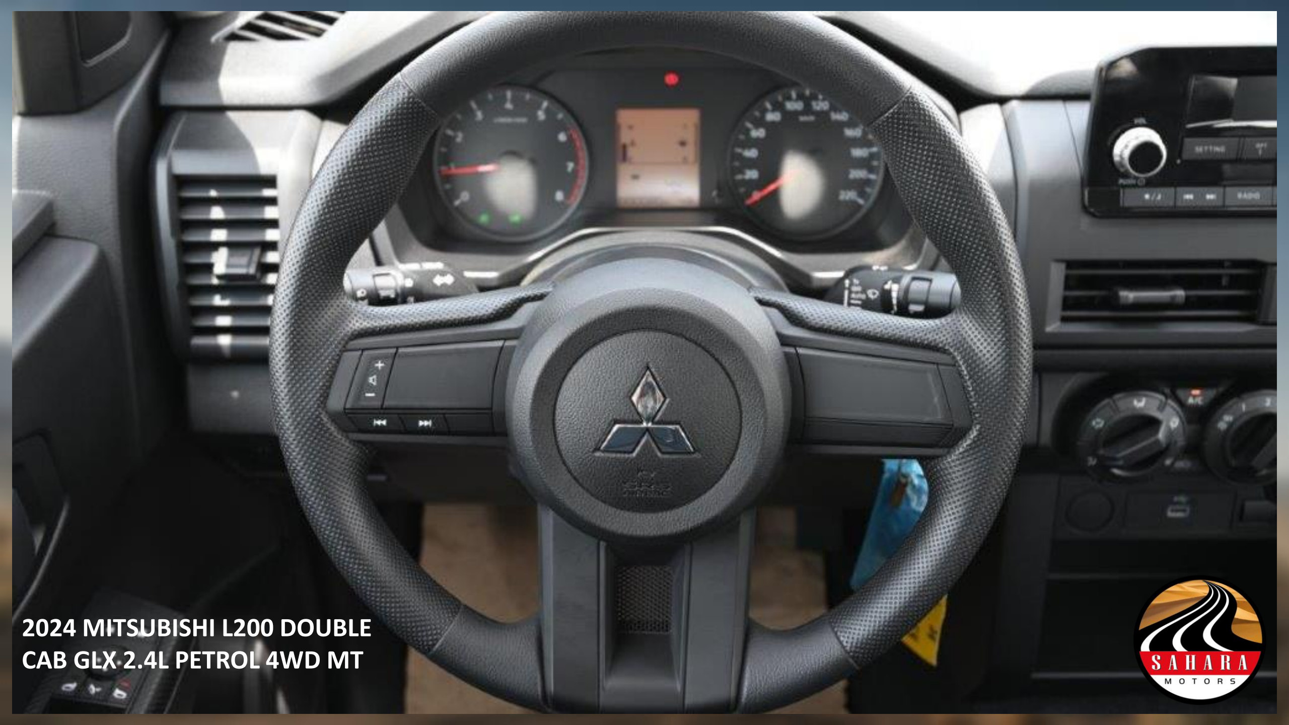
2024 MITSUBISHI L200 DOUBLE CAB GLX 2.4L PETROL 4WD MT