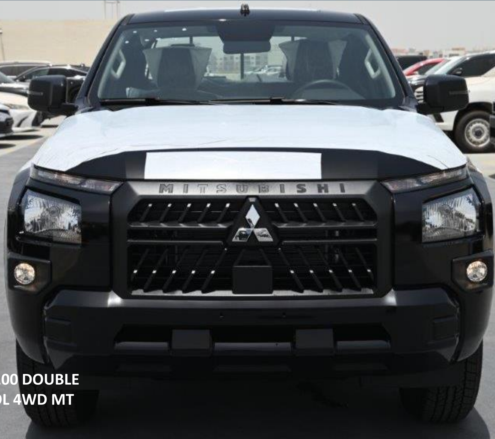
2024 MITSUBISHI L200 DOUBLE CAB GLX 2.4L PETROL 4WD MT